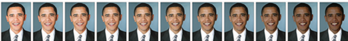
Figure 2. Skin-tone array assessing perceptions of Obama's racial phenotypicality. Center image (sixth image from left) indicates Obama's unmodified U.S. Senate photograph. See the online article for the color version of this figure.

The analysis yielded several main effects. Consistent with the results for voting, there was a significant effect of conservatism, over and above other predictors, including party affiliation, on evaluations of Obama, t(70.87) = 4.99 , p < .01 . Participants who were more conservative evaluated Obama less positively. Also, there was an independent effect of partisanship (Contrast 1, comparing Democrats to Republicans and Independents), t(71.09) = 4.93 , p < .01 . Democrats evaluated Obama more positively than did Republicans and Independents. Republicans evaluated Obama somewhat, but not significantly, less positively than Independents,